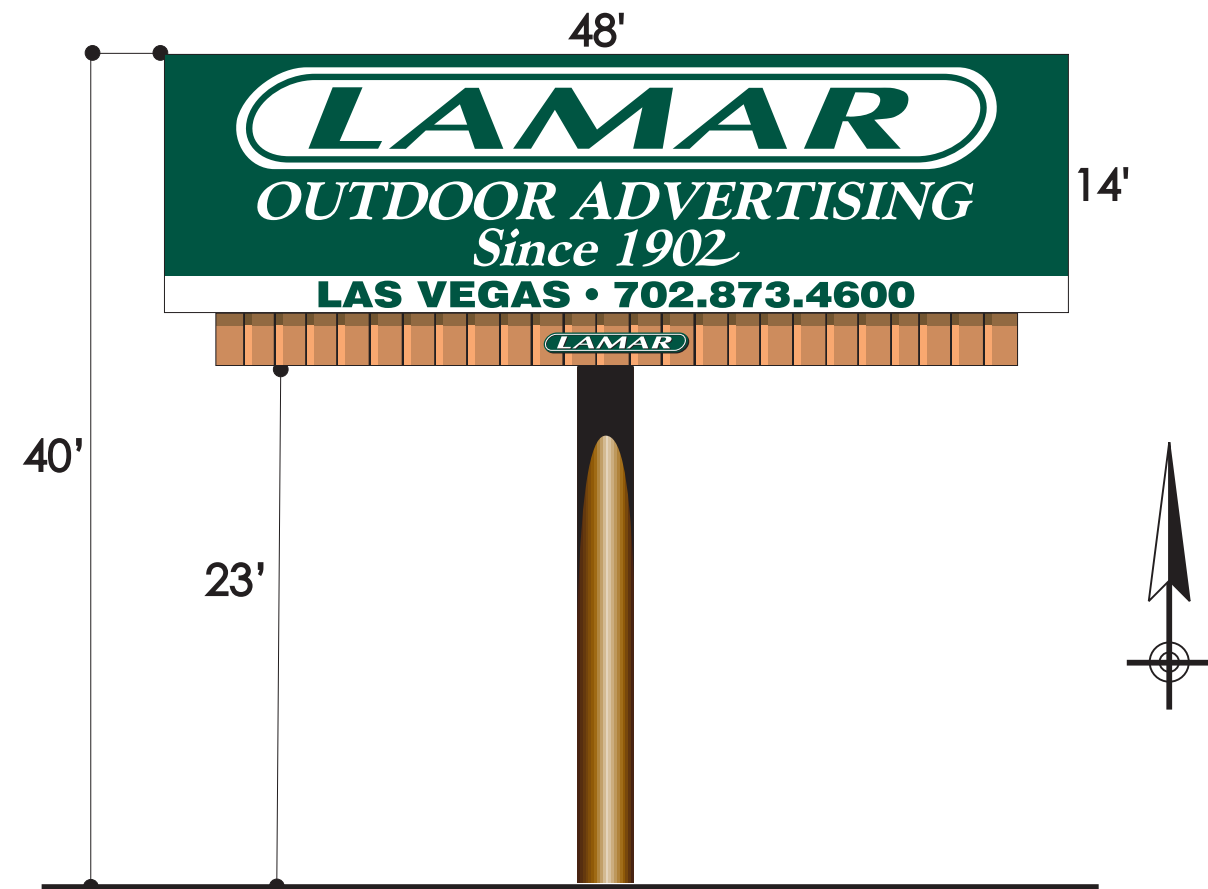
ELEVATION (NO SCALE)